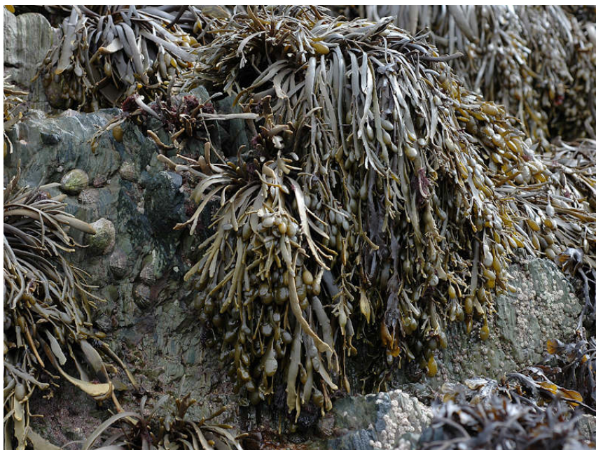
Ascophyllum nodosum on full salinity mid eulittoral rock