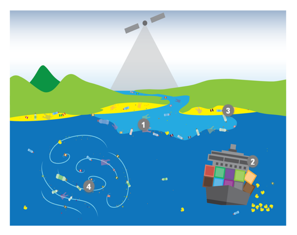
Figure 1. Diagram representing the four observational scenarios discussed in the text (Section 2). (1) River discharge, (2) spills, (3) shoreline accumulation, (4) submesoscale convergence filaments.

Table 1 summarises the link between questions, processes, their spatial and temporal scales and the observational requirements, while Figure 1 presents a graphical summary of the processes involved.