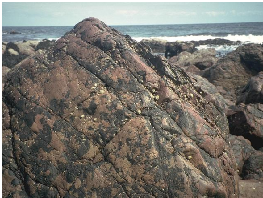
Verrucaria maura and sparse barnacles on exposed littoral fringe rock