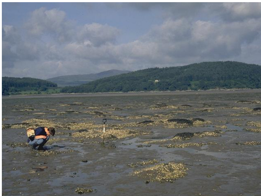
Cerastoderma edule and polychaetes in littoral muddy sand