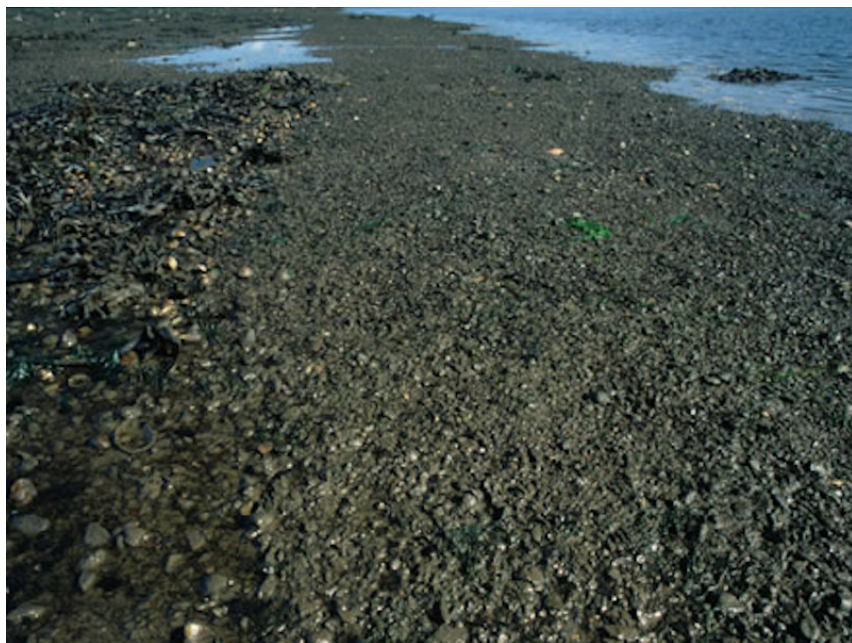
Cirratulids and Cerastoderma edule in littoral mixed sediment