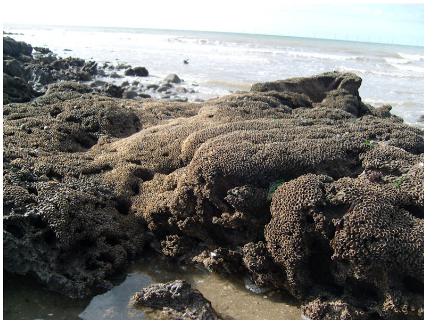
Sabellaria alveolata reefs on sand-abraded eu littoral rock