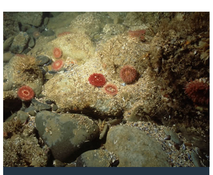
Urticina felina and sand-tolerant fauna on sand-scoured or covered circalittoral rock