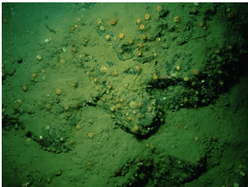
Caryophyllia smithii with faunal and algal crusts on moderately wave-exposed circalittoral rock