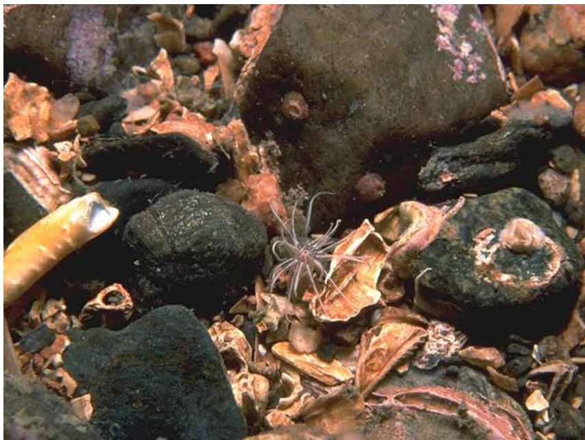
Edwardsia timida on sublittoral clean stone gravel.