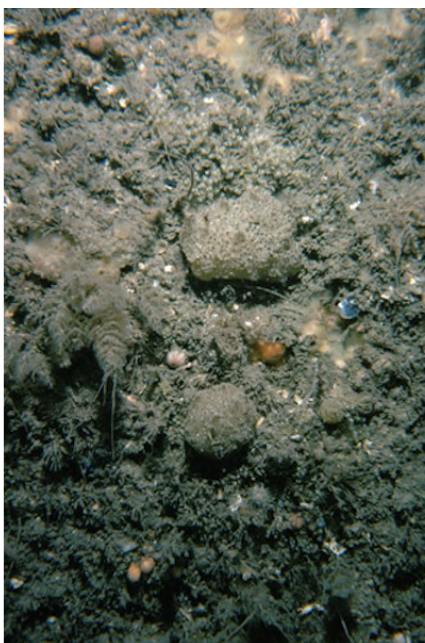
Polyclinum aurantium and Flustra foliacea on sand-scoured tide-swept moderately wave-exposed circalittoral rock