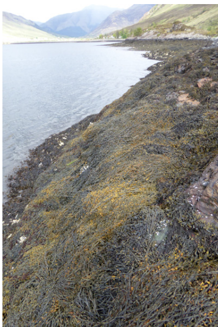
Ascophyllum nodosum and Fucus vesiculosus on variable salinity mid eulittoral rock