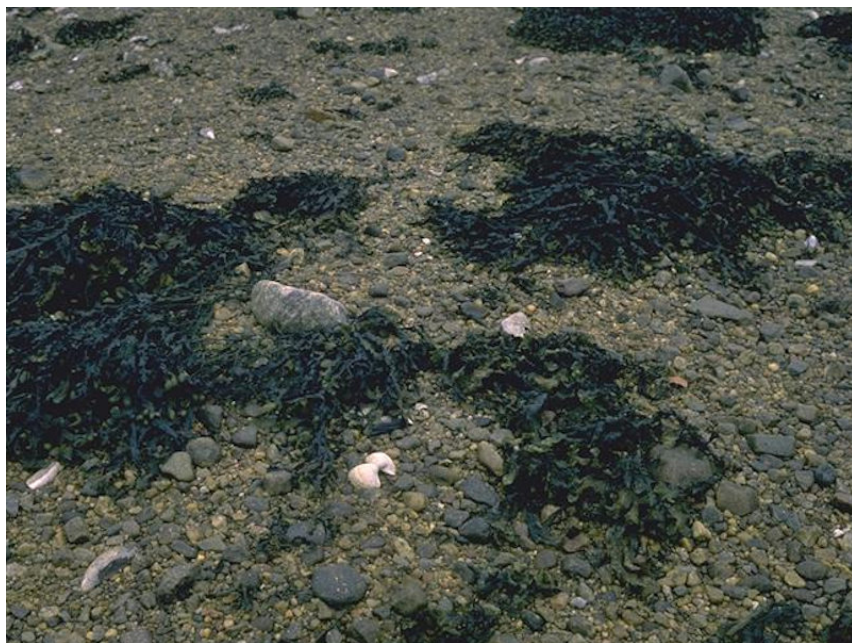
Fucus vesiculosus on mid eulittoral mixed substrata