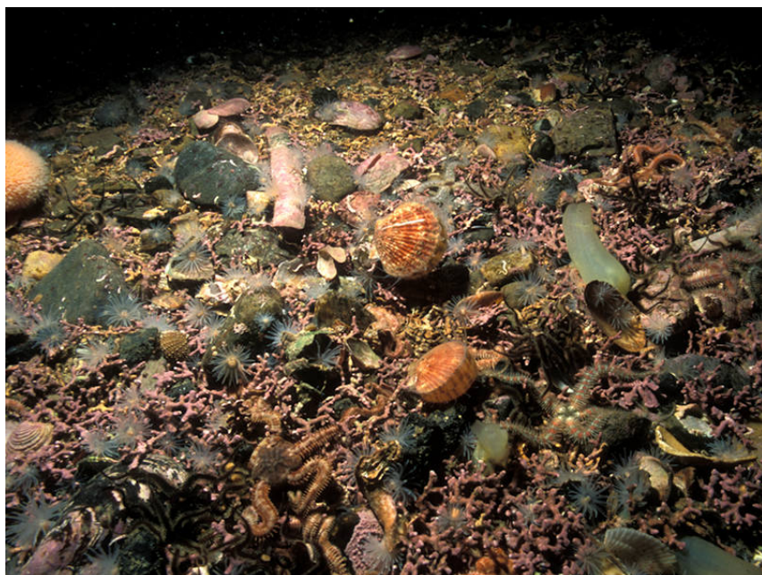
Phymatolithon calcareum maerl beds in infralittoral clean gravel or coarse sand