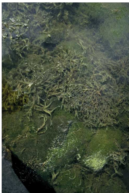
Fucus ceranoides and Enteromorpha spp. on low salinity infralittoral rock