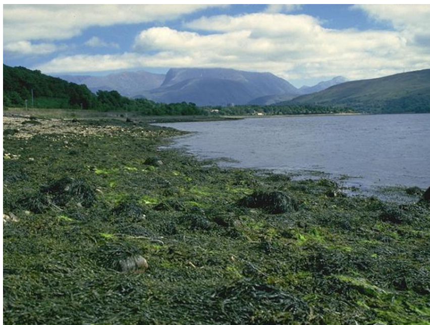
Ascophyllum nodosum on full salinity mid eulittoral mixed substrata