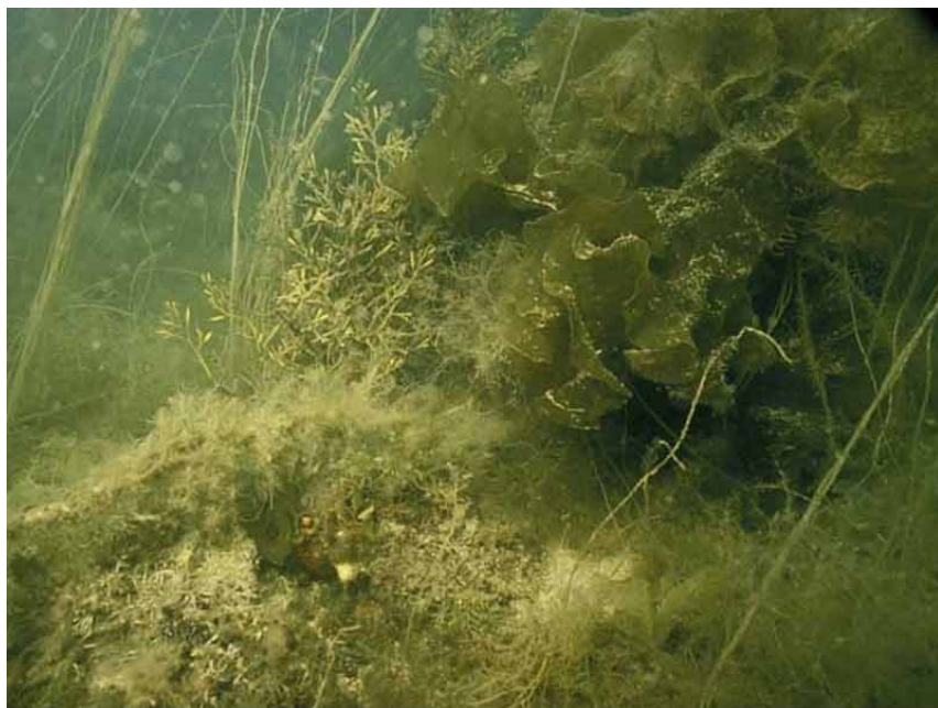
Algae attached to rock including Halidrys .