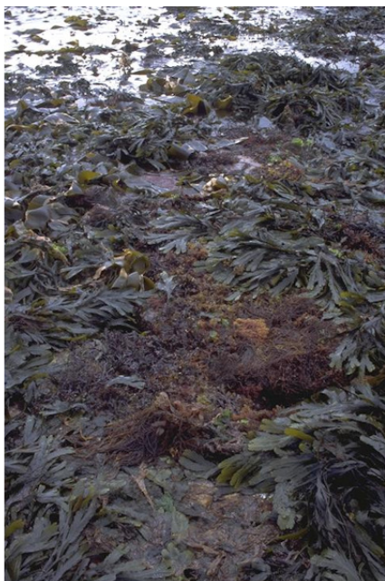
Fucus serratus on moderately exposed lower eu littoral rock