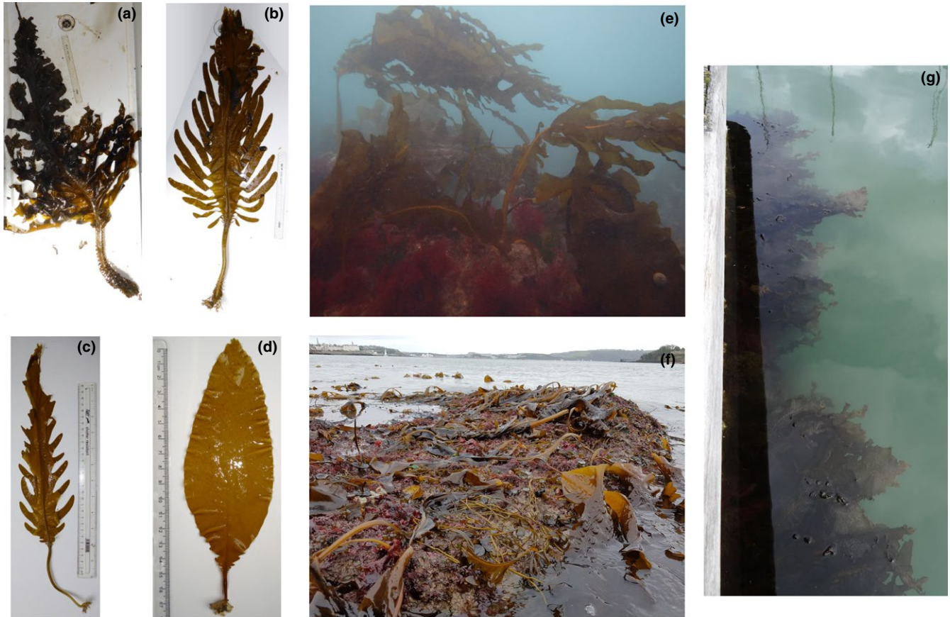
FIGURE 1 Different developmental stages of Undaria pinnatifida sporophytes (a-d). Undaria pinnatifida can be found growing in the subtidal and intertidal, as well as on natural and artificial substrates (e-g)