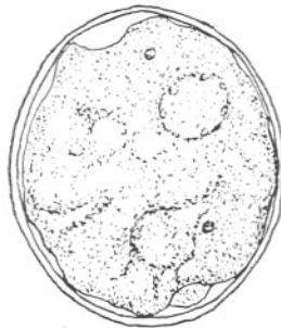
FIG. 2.—Living cyst of Entamoeba phallusia . \times 2000 .

projections of endoplasm appear for a short time between it and the main mass. There is no contractile vacuole. We have not seen the amœba engulf anything, and the granules in the protoplasm do not seem to be food material; it is probable that the organism absorbs its food in a fluid