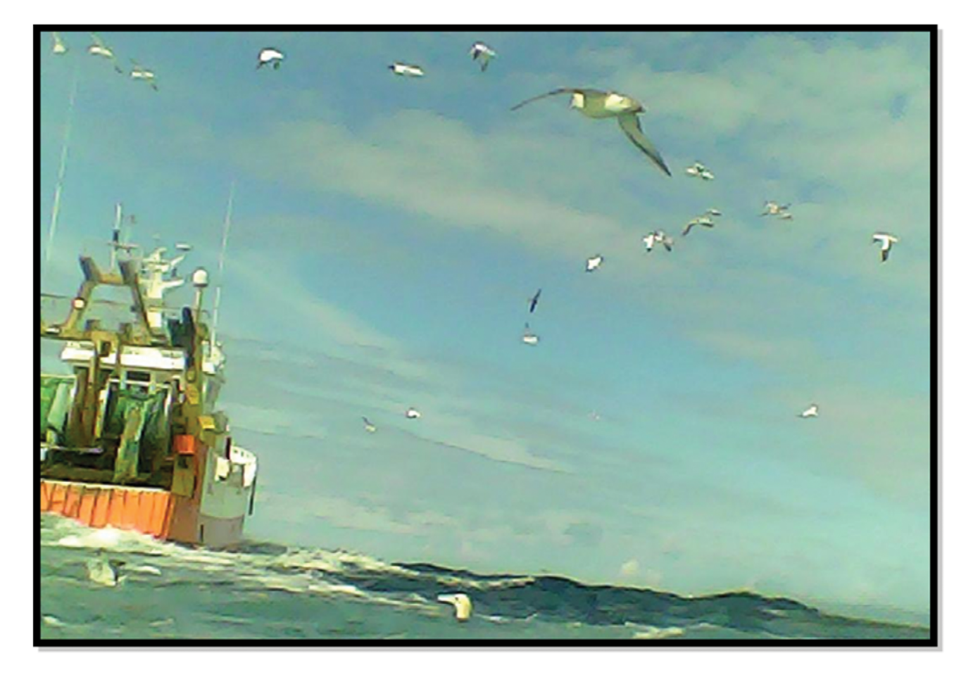
Figure 1. Bird-borne cameras reveal seabird/fishery interactions. All tracked gannets photographed fishing vessels, often in the company of large groups of other scavengers. doi:10.1371/journal.pone.0057376.g001

seabirds and fisheries at meso [17] and sub-mesoscales [15,18]. Nevertheless, even these approaches have a number of limitations: spatial overlap between seabirds and vessels does not necessarily mean interaction; vessel location data is normally gathered at a much coarser resolution than animal-borne tracking devices; gear-type information can be difficult to obtain; not all vessels are legally required to use vessel monitoring systems; and illegal, unreported and unregulated (IUU) fisheries may have significant ecological impacts but remain virtually impossible to monitor [19].