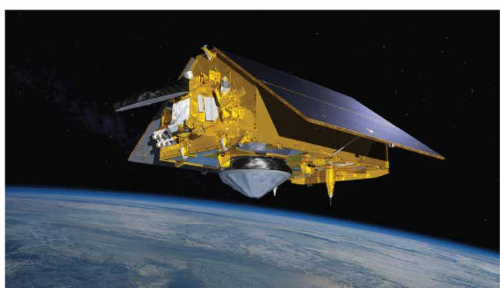
Figure 2. Sentinel-6 Michael Freilich was launched on 21 November 2020 and will be the first to offer fully focused SAR operation over all the ocean between 66°S and 66°N. To achieve a precise intercalibration it will be in a tandem orbit within 30 s of Jason-3 for 12 months.