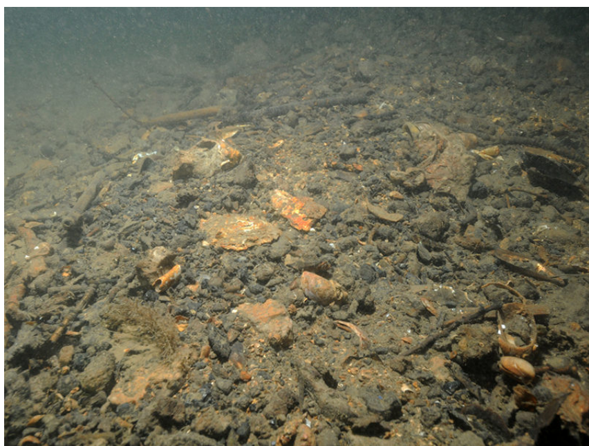
Sublittoral mixed sediment in low or reduced salinity (lagoons)