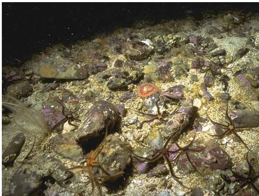
Ophiocomina on cobbles and sediment (ECR.PomByC).