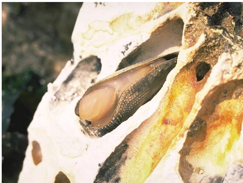
Fucus serratus and piddocks on lower eulittoral soft rock