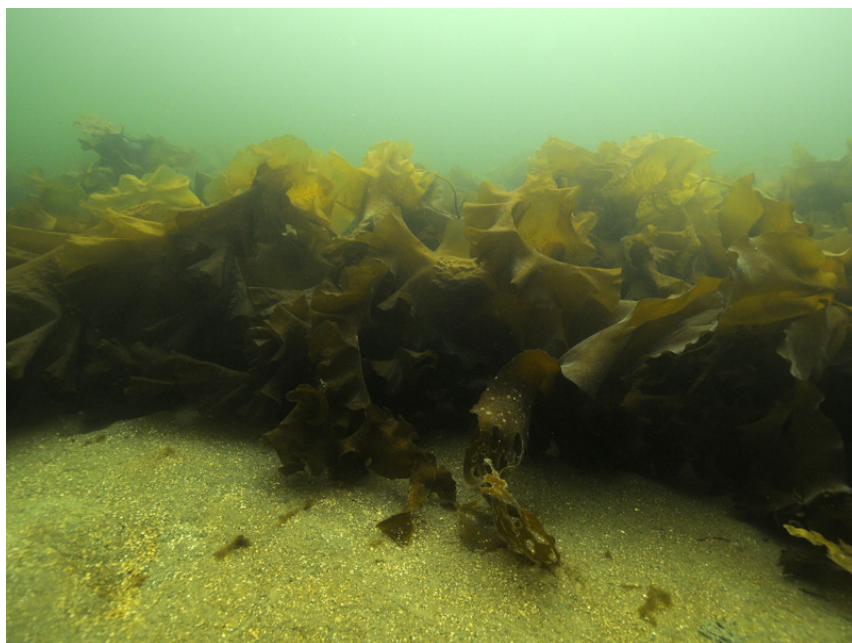
Laminaria saccharina and Chorda filum on sheltered upper infralittoral muddy sediment