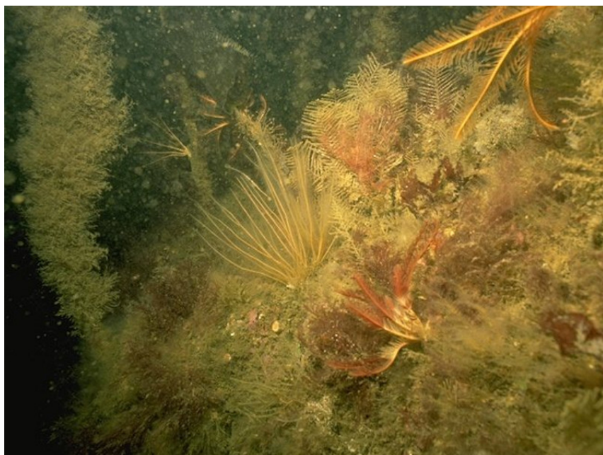
Laminaria hyperborea forest, foliose red seaweeds and a diverse fauna on tide-swept upper infralittoral rock