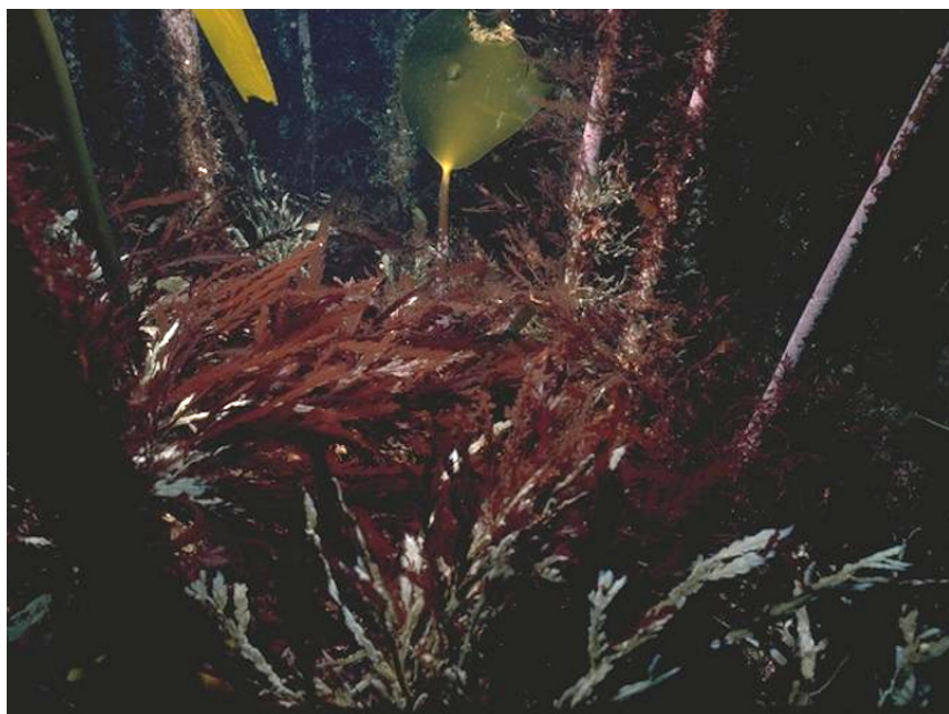
Laminaria hyperborea forest with dense foliose red seaweeds on exposed upper infralittoral rock