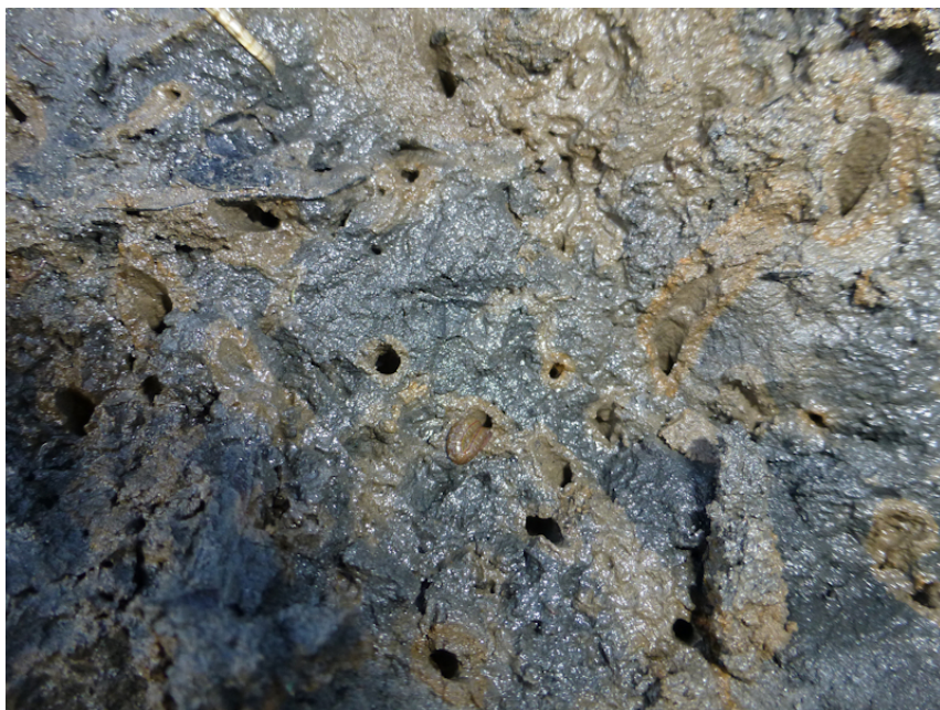
Hediste diversicolor in littoral mud