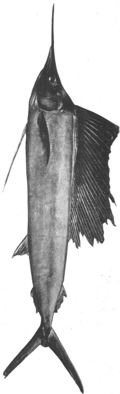
FIG. 1.—Plaster cast of specimen of Sailfish ( Istiophorus americanus ) from the Yealm Estuary, South Devon.