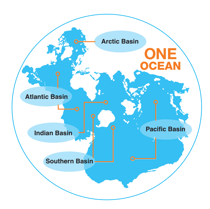
FIGURE 1 There is only one ocean. The ocean is an immense interconnected and heterogeneous whole that provides immeasurable benefits to humanity and the planet

The ocean is an immense interconnected and heterogeneous whole that provides immeasurable benefits to humanity and the planet. It is modulated by a range of physical oceanographic processes, as well as by wind, solar heating, and precipitation. These processes include the thermohaline circulation system on a large scale and more localized coastal currents that are influenced by geomorphology, weather, and tidal conditions. The ocean also comprises a