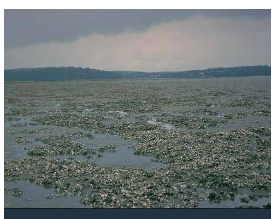
View across a cockle strand (biotope LMS.Pcer).