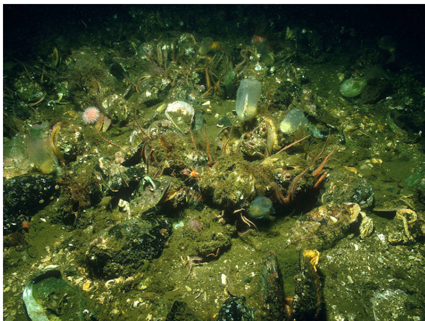
Modiolus modiolus beds with fine hydroids and large solitary ascidians on very sheltered circalittoral mixed substrata