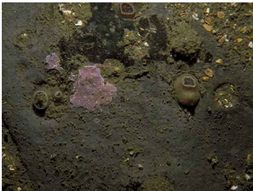
Piddocks with a sparse associated fauna in upward-facing circalittoral very soft chalk or clay.