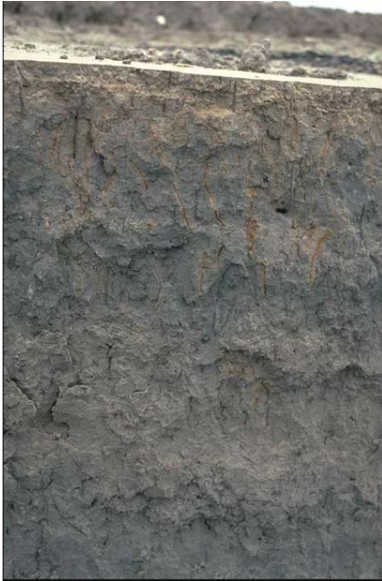
Cross section through the LMS.BatCor biotope.