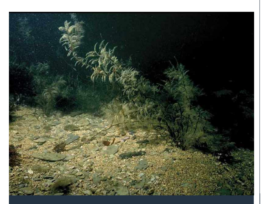
Halidrys on flat pebbles and gravel.

Halidrys siliquosa and mixed kelps on tide-swept infralittoral rock with coarse sediment - Marine Life Information Network