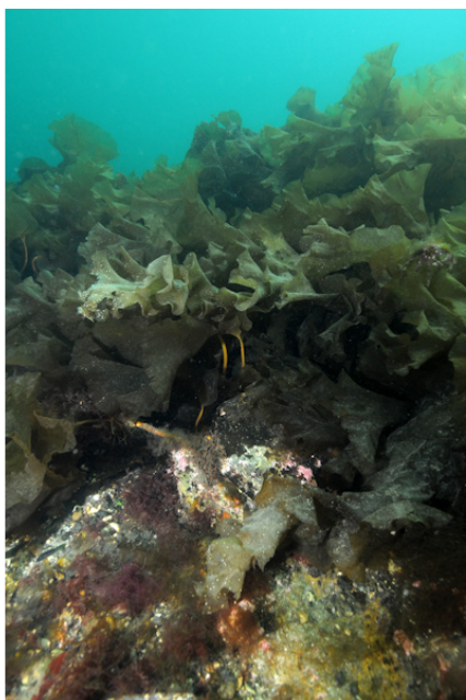
Laminaria saccharina and Psammechinus miliaris on variable salinity grazed infralittoral rock