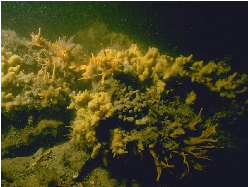
Cushion sponges and hydroids on turbid tide-swept sheltered circalittoral rock