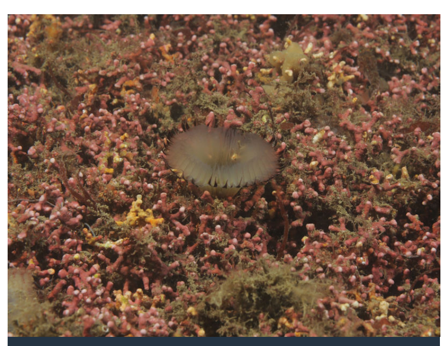
Lithothamnion corallioides maerl beds on infralittoral muddy