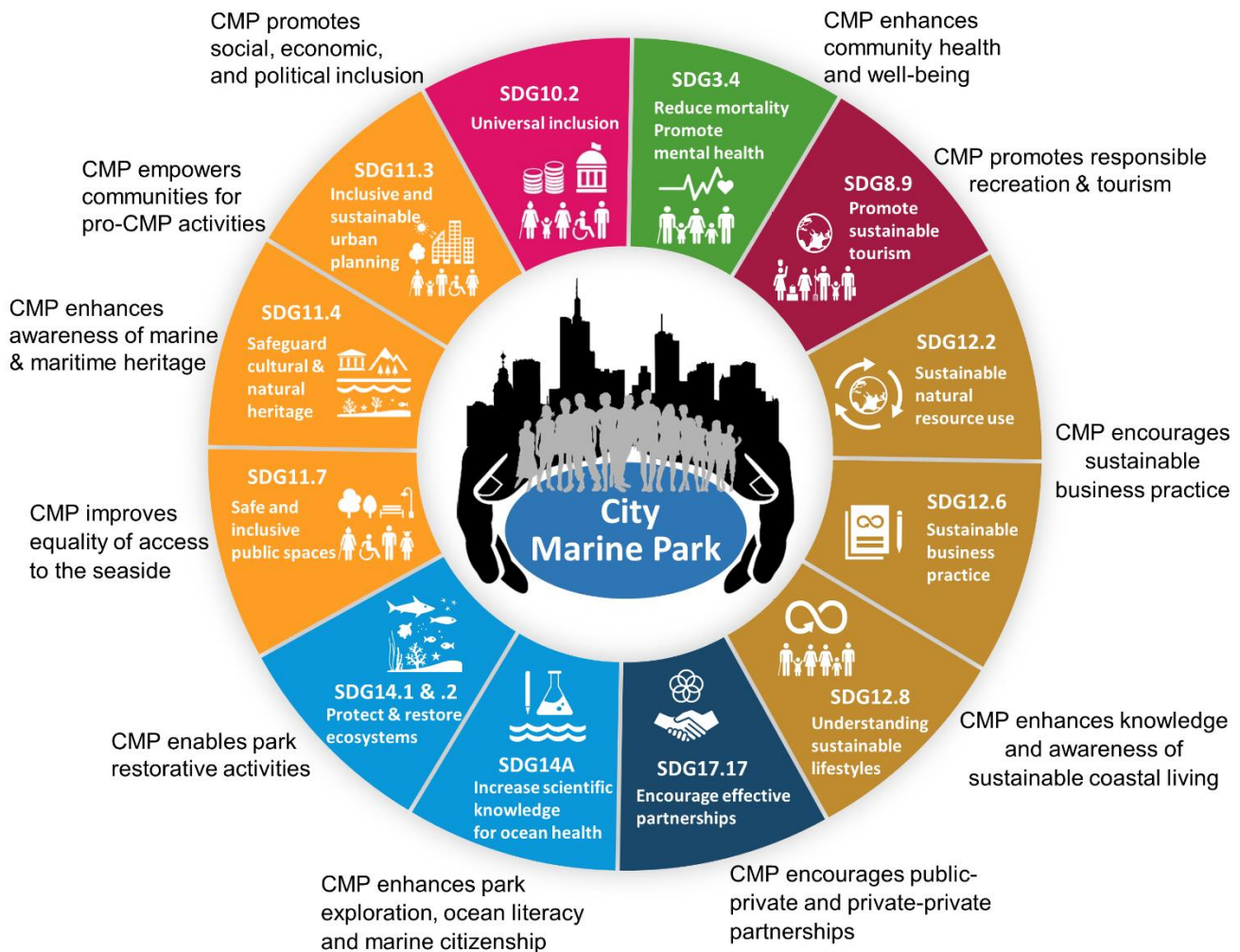
Fig. 3. City Marine Parks form a spatial nexus for addressing multiple interrelated Sustainable Development Goal (SDG) targets. Goal 3 is Good Health and Well-being; Goal 8 is Decent Work and Economic Growth; Goal 10 is Reduced Inequalities; Goal 11 is Sustainable Cities and Communities; Goal 12 is Responsible Consumption and Production; Goal 14 is Life Below Water and Goal 17 is Partnerships.

determined by the location of the park and the bio-physical, cultural and political context. The organisational structure should encourage creative and innovative entrepreneurialism and engage a city's rich social capital. Social capital acts as a catalyst for progress through the stages of the coordination process [133].