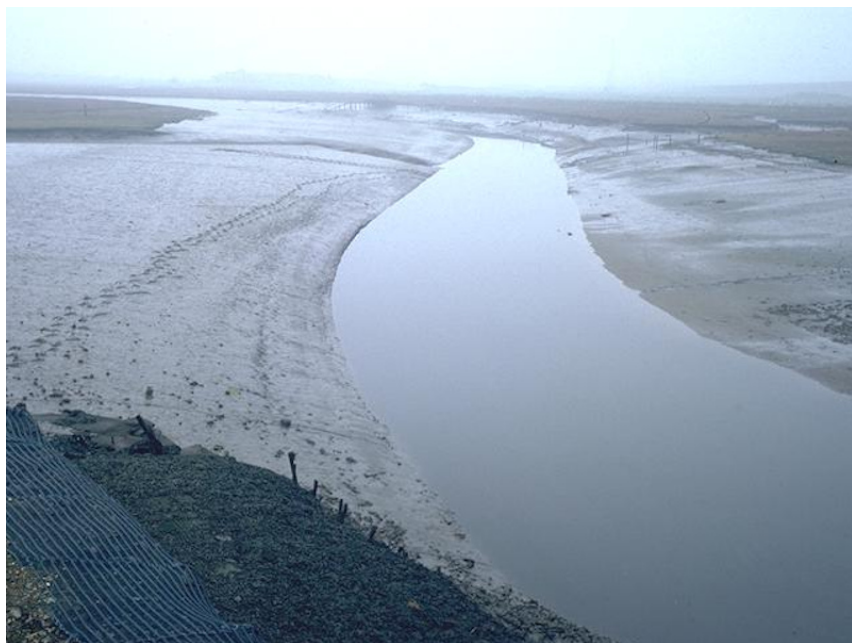
Hediste diversicolor and oligochaetes in littoral mud