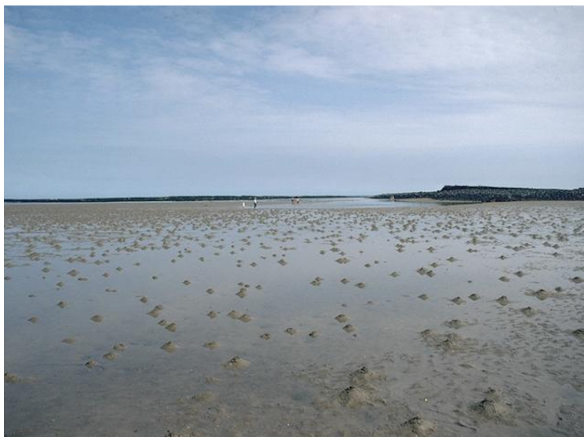
Polychaetes in littoral fine sand