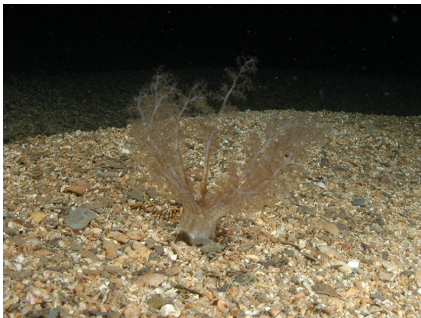
Neopentadactyla mixta in circalittoral shell gravel or coarse sand