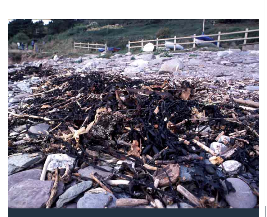
Strandline of seawed and driftwood (LGS.Tal).