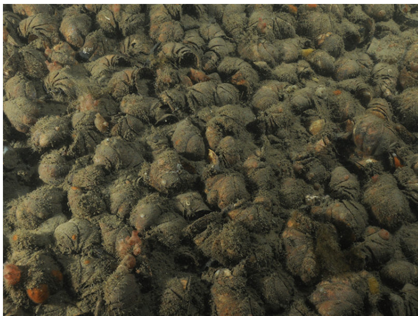
Crepidula fornicata and Mediomastus fragilis in variable salinity infralittoral mixed sediment