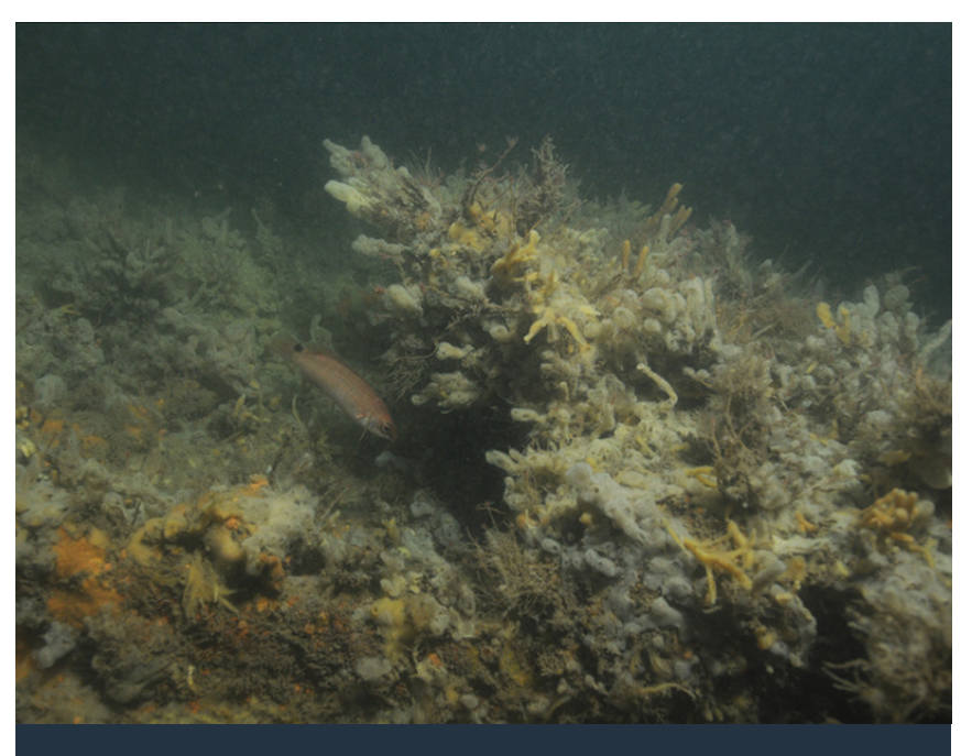
Circalittoral faunal communities in variable salinity