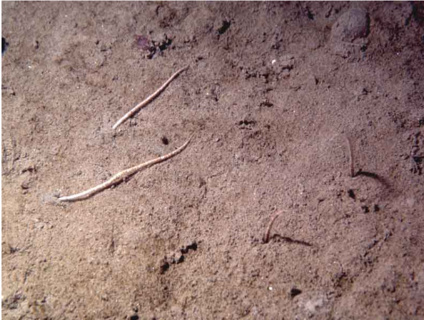
Amphiura filiformis arms visible in circalittoral muddy sand.