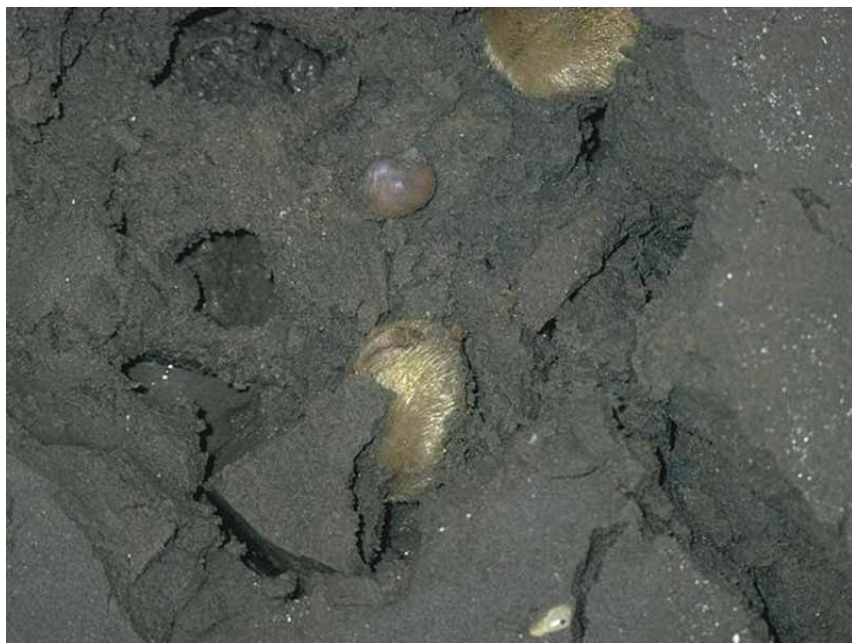
Echinocardium cordatum dug out of sand.