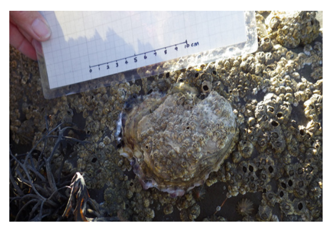
Figure 2: The Pacific oyster Crassostrea gigas recorded from the intertidal zone, south-west Scotland in 2014.

Increasing seawater temperatures are highly likely to have contributed to the recruitment of the commercial Pacific oyster Crassostrea gigas (Syvret et al., 2008; Guy & Roberts, 2010) in natural habitats at a number of more northerly locations in the UK (Kochmann et al., 2012; Cook et al., 2014) and Europe (Wrange et al., 2010), as well as the extensive expansion of this species at existing sites (Herbert et al., 2012). In 2014, a survey was undertaken in Scotland to determine the extent of wild Crassostrea gigas following sightings of this species in the Firth of Forth, SE Scotland (Smith et al., 2014). From the 60 sites surveyed, live wild C. gigas were found in five locations on the north shore of the Solway Firth (SW Scotland) (Cook et al., 2014) (Figure 2). The majority of C. gigas found in the survey were between 50 – 100 mm in length, comparable in size to those found in the Firth of Forth (Smith et al., 2014). This survey determined the current northern most limit for this species on the west coast of the UK (54.8° N). As more northerly populations are recorded, however, in Ireland (55.1° N) (Kochmann et al., 2013) and Scandinavia (60.0° N) (Wrange et al., 2010), it is highly likely that C. gigas will continue to spread further northwards (Cook et al. , 2014).