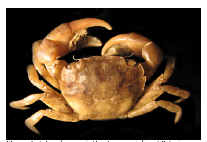
Figure 4: Asian shore crab Hemigrapsus takanoi

These two species of shore crab (Figures 4 and 5) were recorded in the UK for the first time in 2014. Hemigrapsus takanoi from the River Medway, Kent (and retrospectively in preserved samples from a Crassostrea gigas reef in the Colne, Essex in 2013) (Wood et al., 2015a) and H. sanguineus from the shores of Glamorgan and Kent (Seeley et al., 2015). Sea temperatures are currently well within the required parameters for H. sanguineus to become established, with mean summer sea temperatures >13 °C. This temperature was suggested by Stephenson et al. (2009) as the threshold below which the species was not found in Maine, USA. They also reported that mean population densities and reproductive activity increased as mean temperatures exceeded 15 °C and 12 °C, respectively. With current North Sea average summer SST ranging between 14 °C and 16 °C and a predicted future minimum temperature of 15 °C, it would appear likely that the species will benefit from predicted warming and become more abundant in this region. In addition, as storm damage and flooding (phenomena linked to climate change) increases in coastal areas, it is more and more likely that coastal defence structures will be used, with the potential to create additional refugia and suitable habitats for the Asian shore crabs.