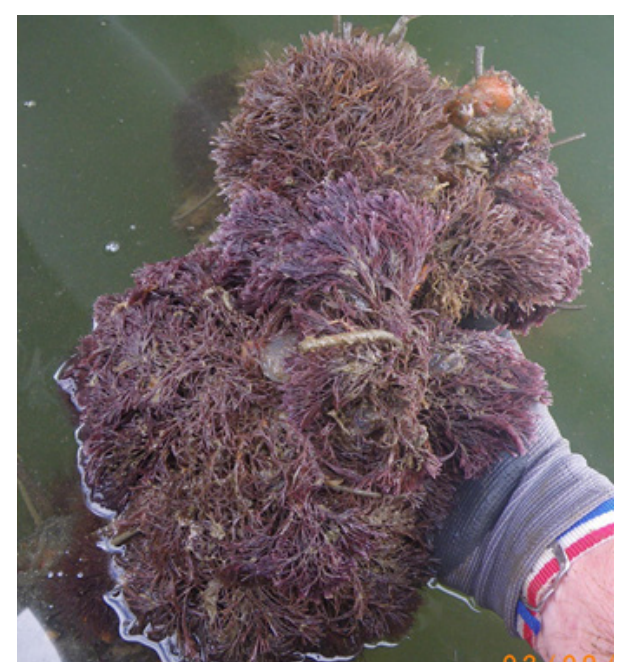
Figure 3 : The ruby bryozoan, Bugula neritina