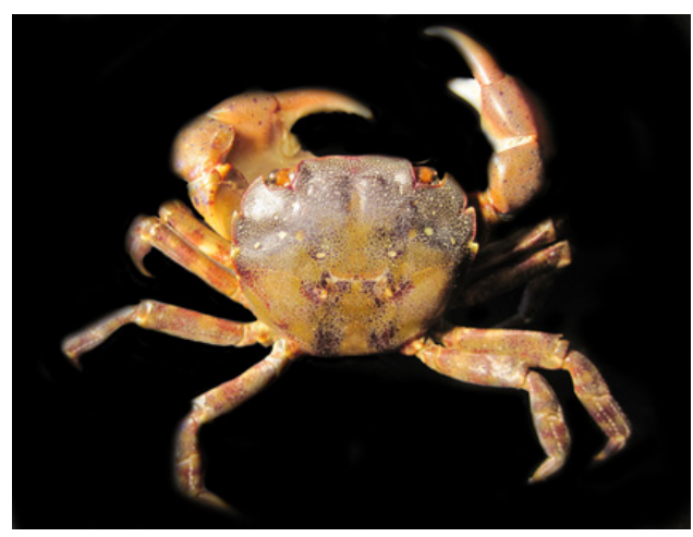
Figure 5: Asian shore crab Hempigrapsus sanguineus © Jack Sewell, MBA.