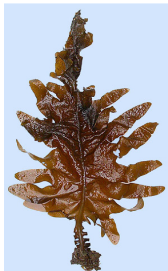
Figure 6 : Wakame – Undaria pinnatifida