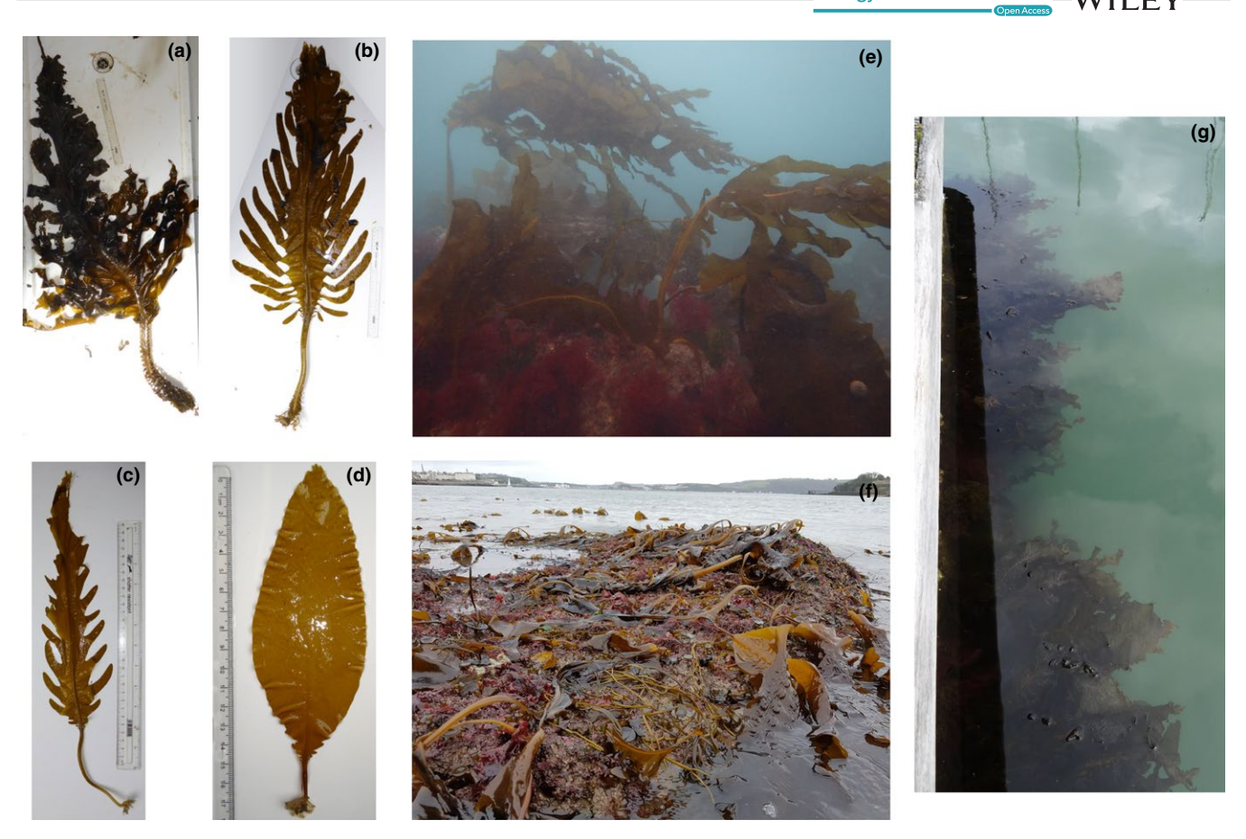
FIGURE 1 Different developmental stages of Undaria pinnatifida sporophytes (a–d). Undaria pinnatifida can be found growing in the subtidal and intertidal, as well as on natural and artificial substrates (e-g)