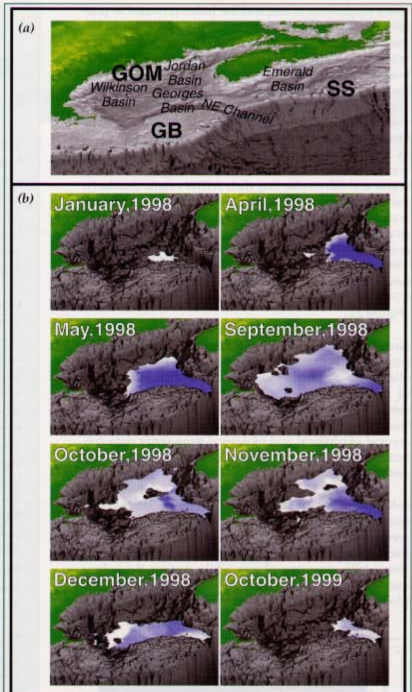
Figure 2. (a) The GOM/WSS region. (b) The intrusion and subsequent replacement of LSSW in the deep basins of the GOM from January 1998 through October 1999. Percent composition of LSSW in deep waters are indicated in shades of blue, with the lightest shade corresponding to 20% LSSW and the darkest shade corresponding to 100% LSSW.

In addition to its southwestward advance along the shelf break, the LSSW also made extensive incursions into the deep basins of the GOM/WSS region (Figure 2) (Drinkwater et al., in press). Although located on the continental shelf, these deep basins contain large quantities of slope water derived from off the shelf (Brown and Irish, 1993; Petrie and Drinkwater, 1993). From the 1970s until 1997, the deep waters of these basins were relatively warm and salty, reflecting their ATSW origin. By the early winter of 1998, LSSW had replaced the deep waters of Emerald Basin on the WSS and began entering the GOM through Northeast Channel. This relatively cool, fresh LSSW continued to advance through the deeper regions of the GOM, replacing the deep waters of Georges Basin by the spring of 1998. By the early autumn of 1998, the hydrographic properties of the deep waters in Jordan Basin and Wilkinson Basin